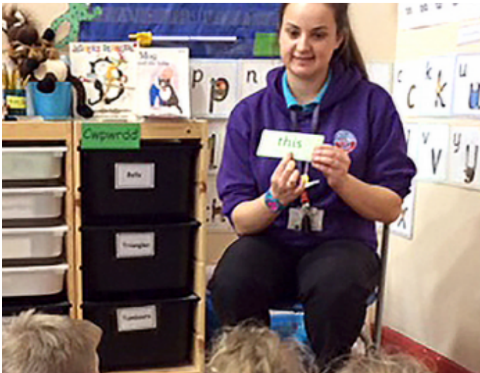
A teacher at Palmerston Primary School

Days are tailored to the specific needs of our school, keeping our teachers up-to-date with the latest research and techniques.