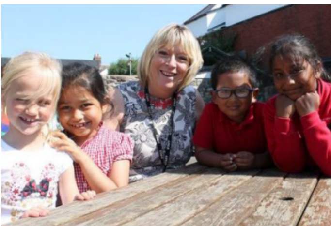
Students at Severn Primary School

H: "We have been teaching the programme since 2009 and have seen improvements in literacy year-on-year. We identified a need for a consistent, whole-school approach. Our Headteacher read case studies of schools using different programmes that had transformed literacy teaching (we hope this one inspires you to take on the programme!) and then visited a Read Write Inc. Model School. It perfectly suited our needs. We haven't looked back. We use the programme across the whole school. This ensures consistency and means every teacher has the skills to teach any child to read. It gives us a common language to understand literacy challenges."